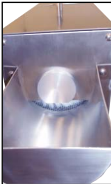
CLOSE UP VIEW OF INLET CHUTE