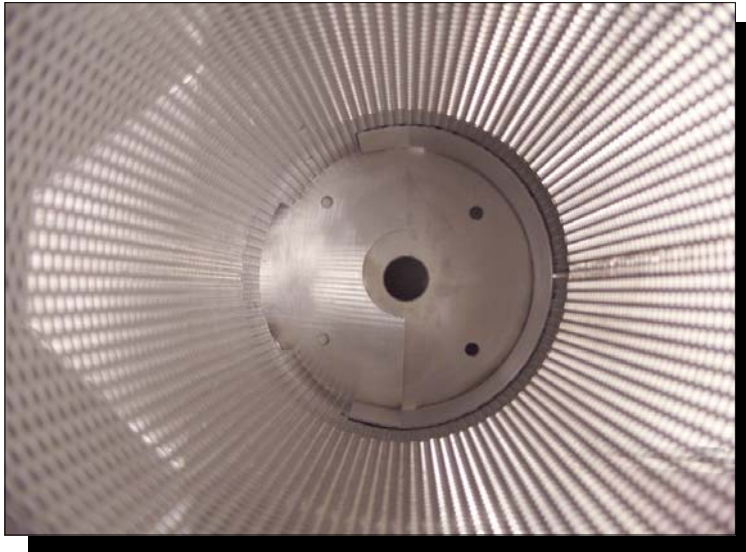
INSIDE VIEW OF DEDUSTING CHAMBER