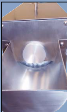
CLOSE UP VIEW OF INLET CHUTE