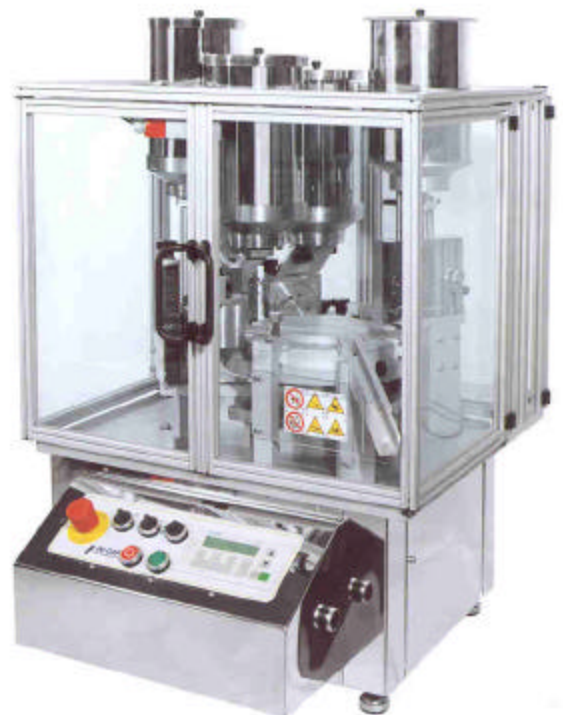
1 st 2 nd 3 rd dosing groups for pellets