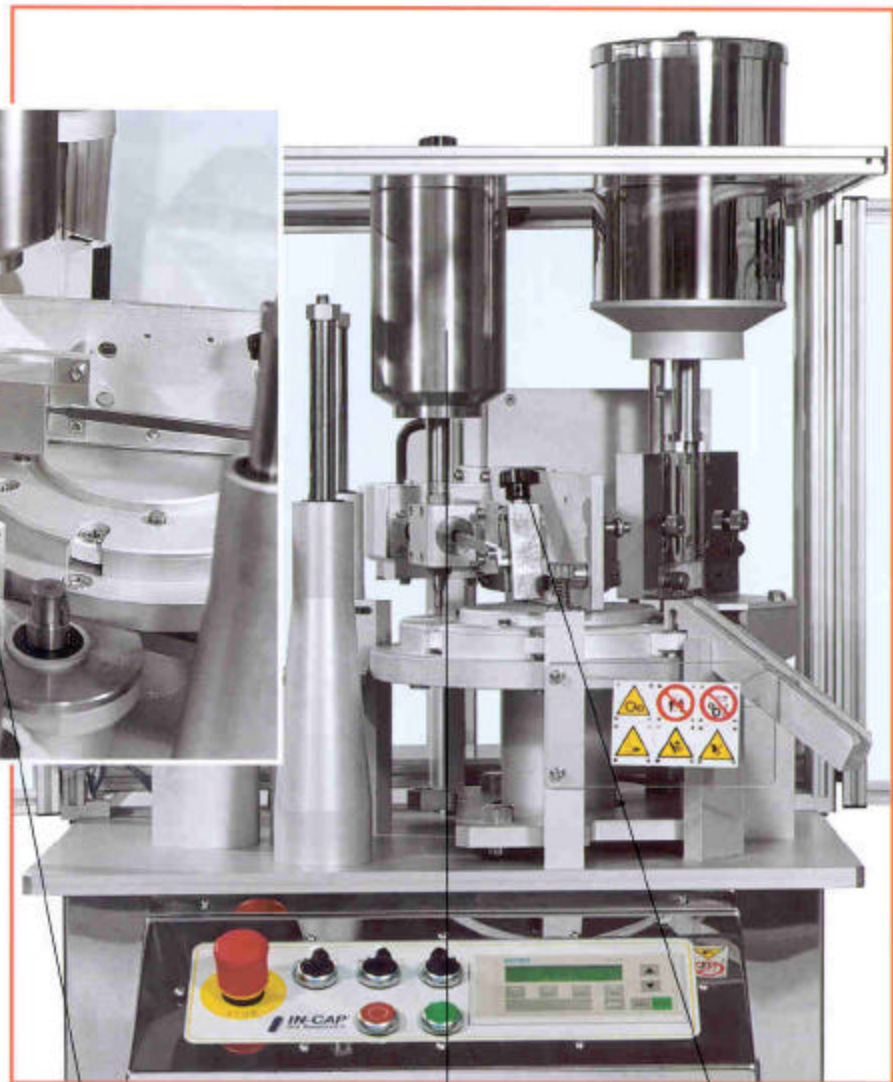
Filling nozzle with "no capsule - no fill" device