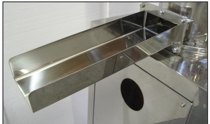
Product Discharge Chute